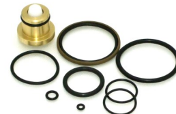
10308161 SEAL KIT

Offering: XL Engineering also offers Seal Kit 10308161 and Pilot Valve 33050008. Please contact us for pricing and availability.